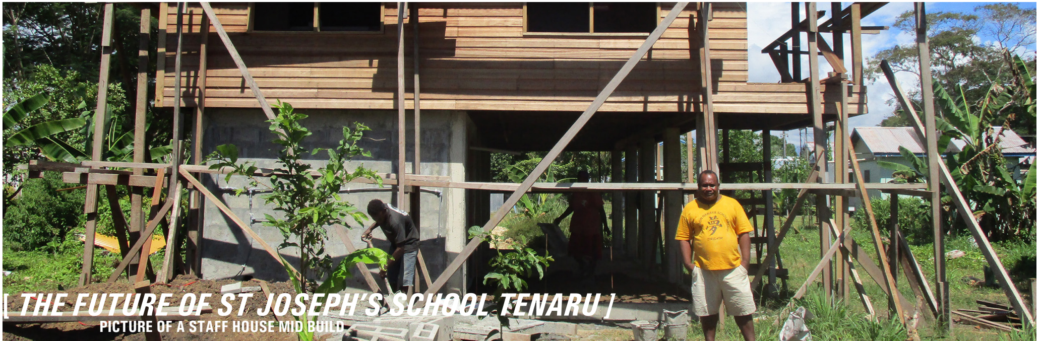
[ THE FUTURE OF ST JOSEPH'S SCHOOL TENARU ] PICTURE OF A STAFF HOUSE MID BUILD

Access to education for the youth of the Solomon Islands can be problematic due to most of the country's population of over 600,000 being widely dispersed in small villages.