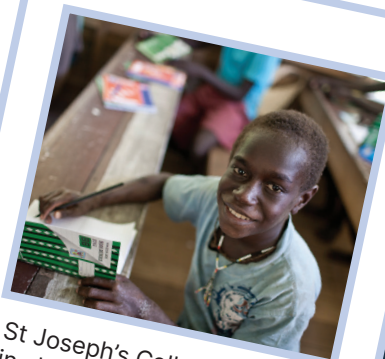
St Joseph's College student in class.