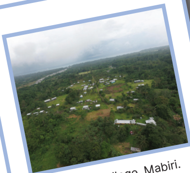
St Joseph's College, Mabiri.