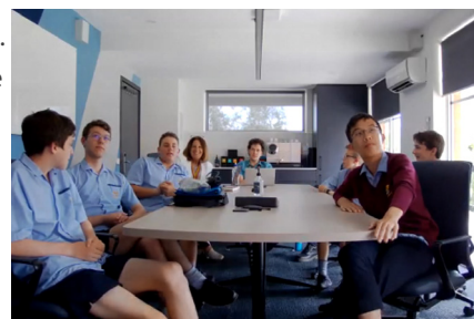
Students- Marcellin College Bulleen