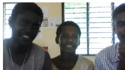
Students-St Joseph's College, Mabiri

To shed light on the 2023 Bougainville Campaign, AMS hosted its annual 'Teacher Briefing' and 'Student Briefing' events during the month of March. Teachers and students alike were able to delve into the School's Campaign Kit and learn more about its resources and fundraising objectives. Both sessions held a Q & A segment where participants could meet and hear directly from teachers and students at St Joseph's about life at the school and the barriers they face daily. Participants were also given the opportunity to ask questions of the guests directly, which made for a great cultural and informative exchange between both parties.