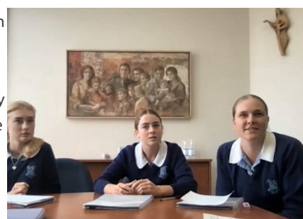
Students- Red Bend Catholic College